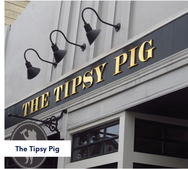
The Topsy Pig