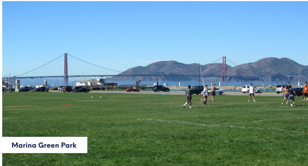
Marina Green Park