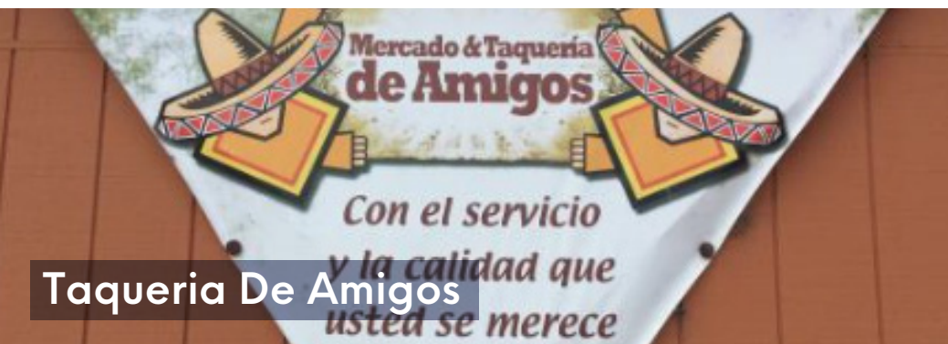
Taqueria De Amigos